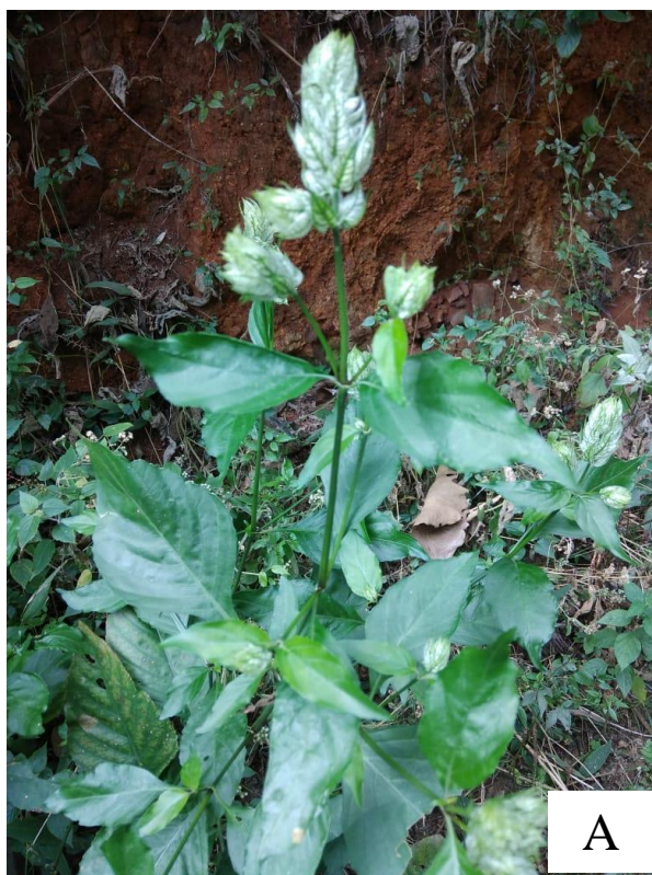
Fig. A. Habit of Justicia betonica L.

Acanthaceae family comprised of herbs, shrubs and vines of 2500 species classified under 200 genera (Willis, 1966). Most of them are shrubs, tropical herbs or twining vines. Characteristic features of Acanthaceae are opposite pairs of leaves, presence of calcium carbonate crystals in vegetative parts, bisexual flowers, large and petaloid bracts, 4-5 petals and sepals, 2-4 stamens, staminodes, superior ovary with 2 fused ovules. The members of Acanthaceae are horticulturally important and cultivated as ornamentals (Amirul-Aiman et al. , 2013; Awan et al. , 2014).