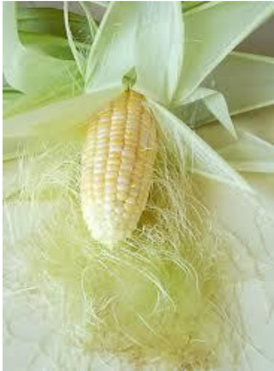
Figure 3. Corn cob