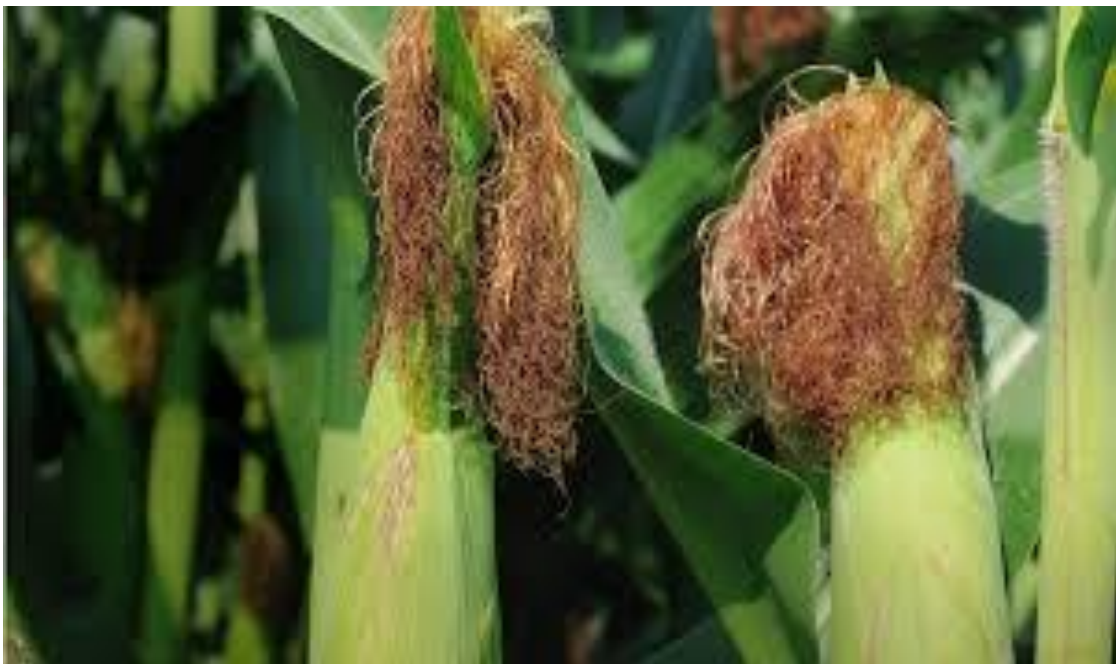
Figure 2. Maize plant at full maturity