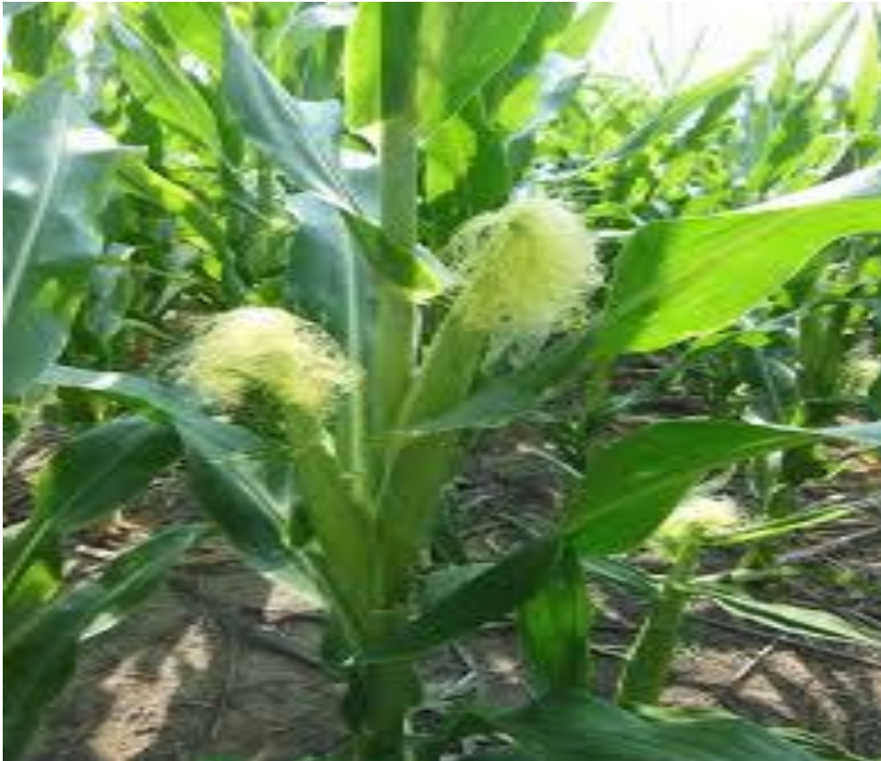
Figure 1. Maize plant still growing in the field