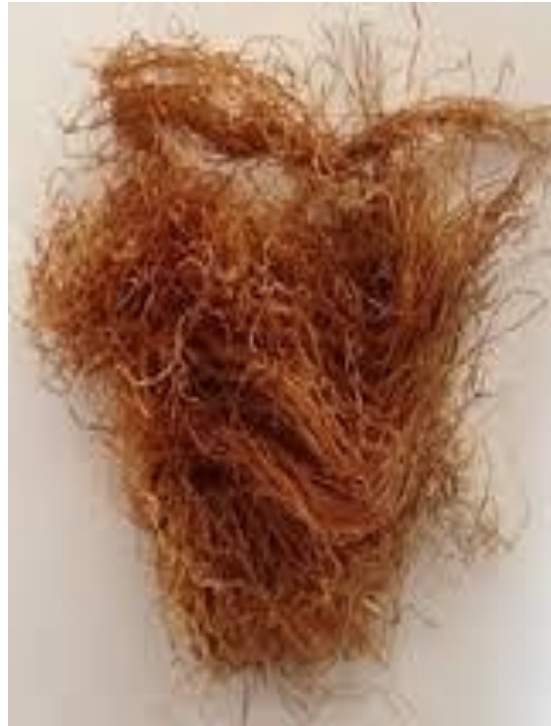
Figure 4. Corn silk