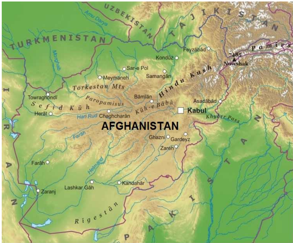
Figure 1. Afghanistan map and transboundary rivers.

Eastern River Basin, with area coverage of about 12 percent holds around 26 percent of the water flow. 6