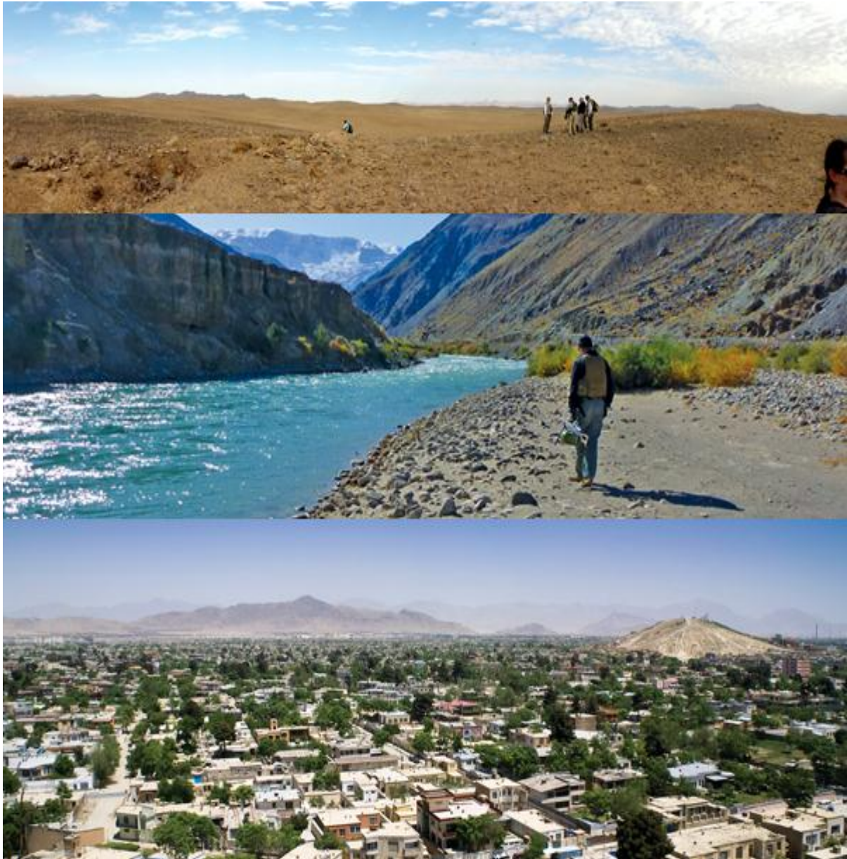
Photo 1. A tale of three Afghanistans: Deserts, mountain streams and growing cities. [8].