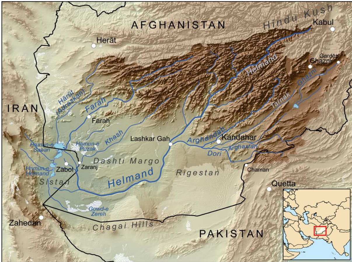
Figure 3. Helmand River Basin.