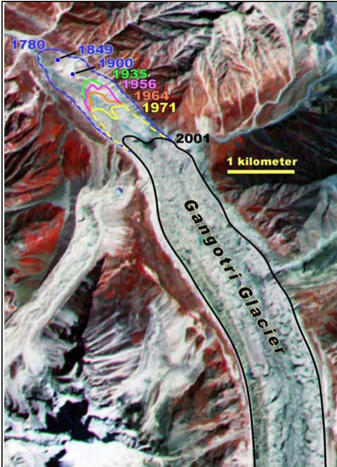
Figure 2. Evidence of Gangotri glacier retreat.